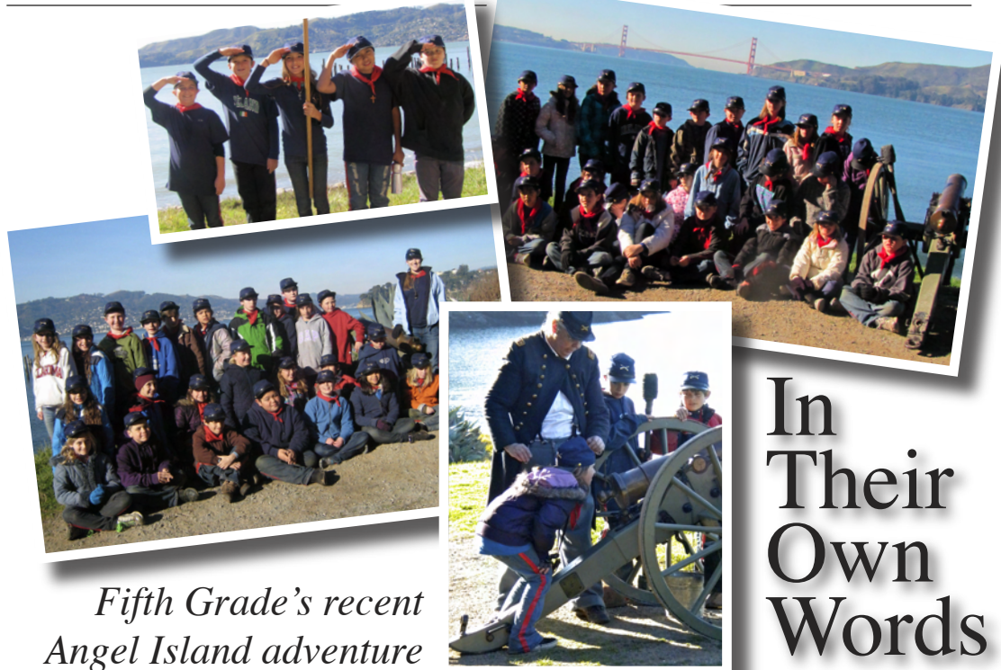
Fifth Grade's recent Angel Island adventure